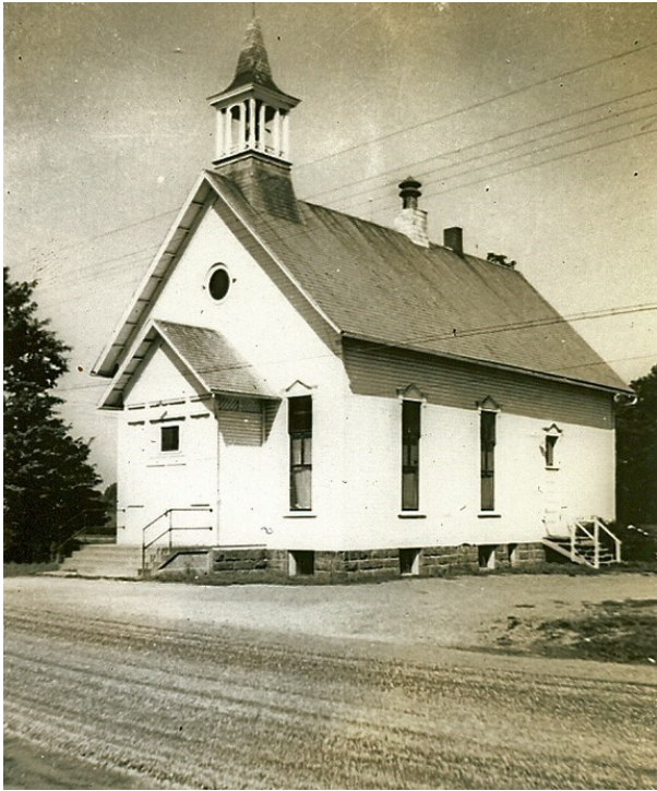
This photo of the Richfield Town Hall was taken on September 25, 1938. Note the siren mounted on the roof.

The Richfield Historical Society Board of Trustees meets the first Monday of each month at the museum housed in the Old Town Hall.