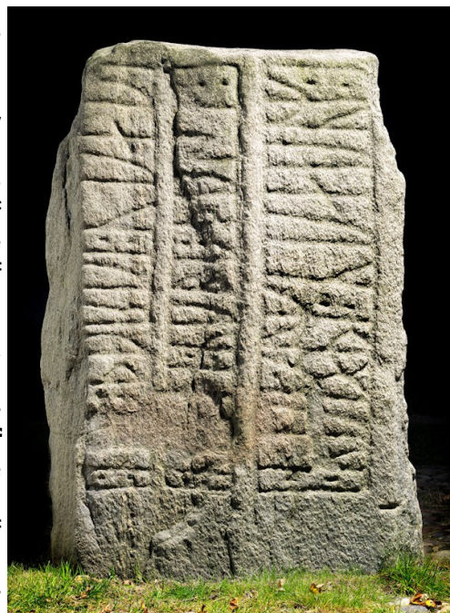
The Jelling 1 stone, commissioned by Thyra's husband Gorm the Old to commemorate her.

In January 1915, Britain suffered its first casualties from an air attack when two German zeppelins dropped bombs on Great Yarmouth and King's Lynn on the eastern coast of England. The zeppelin, a motor-driven rigid airship, was developed by German inventor Ferdinand Graf von Zeppelin in 1900. During World War I, Germany employed these hydrogen-filled behemoths to rain bombs on Britain in hopes that the bombings would spark such fear that it would force the country out of the war. In fact, the military ramped up zeppelin production to the point that Germany ceased production of sausage because the intestinal linings of cows that were used as sausage skins were required to fashion the skins of the zeppelins' leak-proof hydrogen chambers. (A quarter-million cows were needed to build one zeppelin.)